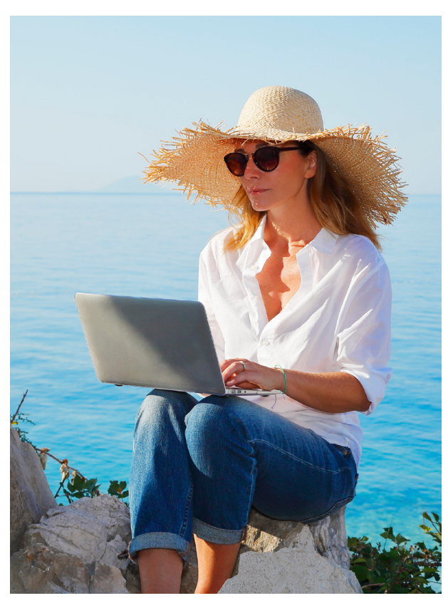
September 2015 SRF Chartered Accountants 2

And remember, non-residents for tax purposes are not required to pay the Medicare levy, so you can claim the number of days that you are not an Australian tax resident during an income year as exempt days in your tax return.